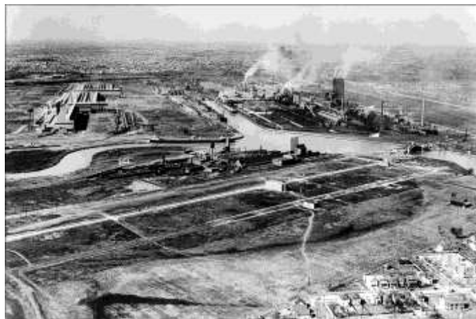
The Ford Rouge complex pictured here in 1927

Our aim is to make record of those Lincoln Park families whose lives have touched The Rouge over the intervening years, whether your family was one of the early ones or settled here after World War II, or later. If your family has had a relationship with The Rouge over the years, we want to hear from you. And do pass the word along to your neighbors and friends, too.