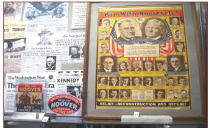
Photo showing part of the Presidential Campaign exhibit in the main display case through August 6 th