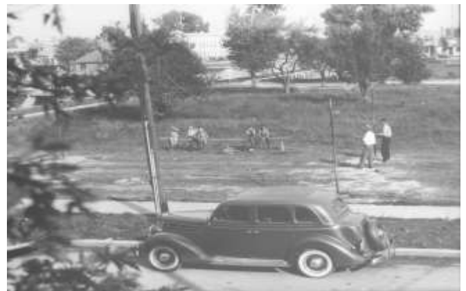
[this view is from the roof of City Hall, built in 1935]

The Museum building will also be getting in on the act; the photo below – to be on view in a front window of the museum – shows a community park (where horseshoes were played) at Fort Park and Southfield in the late 1930s, before the post office building was erected on the site in 1938.