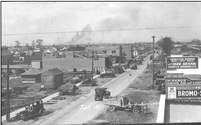
Fort Street building boom in 1925 (smoke from the Ford Rouge factory seen in distance); photo taken from the roof of State Savings Bank, corner of Fort and State (Southfield Rd)

Along with the city, 90 th anniversary observances will be celebrated this year by the municipal Fire Department and the Lincoln Park Exchange Club, the city's oldest and longest-continuing service club.