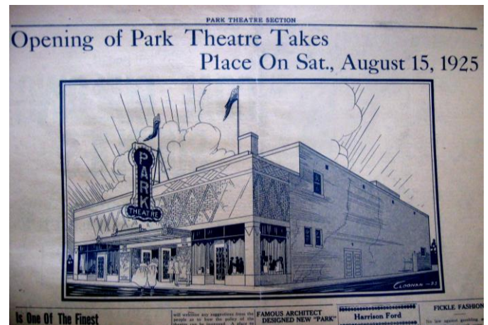
Rendering of the new Park Theatre, Lincoln Park News , August, 1925 (also see photo on back of newsletter)

The brick dedication form is enclosed here for your use and further information. Monday April 6 is the deadline for submissions for the first phase of installation. Brick dedication forms will continue to be accepted, with pavers placed throughout the year. The ongoing Heritage project will also help to raise needed funds for the upkeep and continued operation of the Historical Museum.