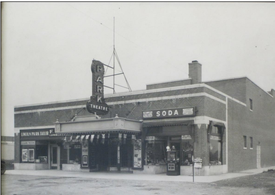
The Lincoln Park Theater with its original facade before remodeling project in the late 1930s