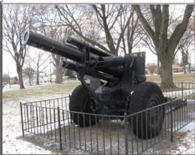
The famed French “75” field gun was used by the U.S. Army in the First World War. The artillery piece now located in Memorial Park has been a part of the Lincoln Park War Memorial since 1938.