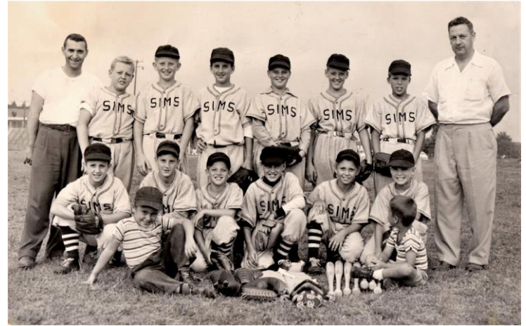
1953 Sims team, South Division

[See additional photos on the next page]