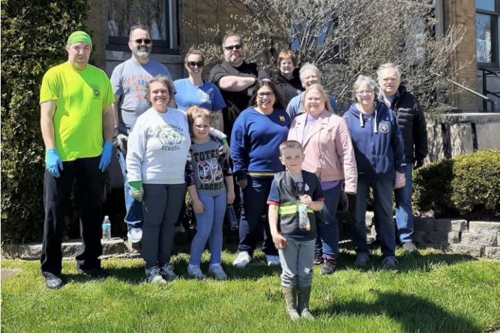
Thanks to our Clean Up Team!