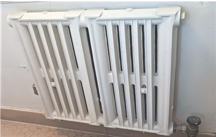
One of the museum’s original radiators

Visitors to the museum – formerly the L.P. Post Office building, built by the U.S. Treasury Department in 1938-39 – often ask about that odd sound they hear when visiting during the winter days. The hissing sound comes from the radiator valve. This happens normally as the steam first enters the radiator pushing air out, then shuts off when the radiator is fully heated to selected temperature. Radiated heat – using water or steam – was the most common form of heating prior to forced-air. It is still found in many older buildings and homes, and is often preferred in newer construction due to its efficiency. When the heat temperature is set at the thermostat, the natural gas-fueled boiler below begins to heat water, conducting steam through the pipe system to the radiators located around the building.