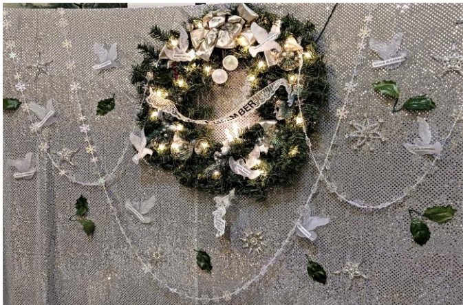
2022 Memorial Wreath