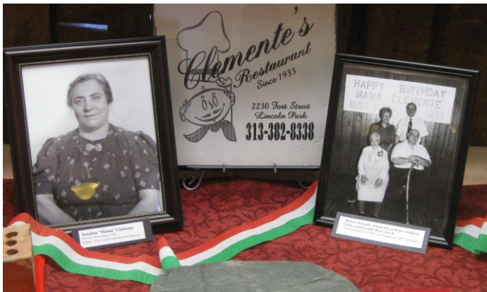
Photo showing a part of the museum's 2014 Clemente's exhibit

Society members are cordially invited to the return of the annual historical society spring dinner (after three years of pandemic). We will also be returning to the Lincoln Park High School cafeteria, where the catering department has provided wonderful past experiences.