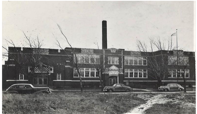
A view of the original Raupp School circa 1940s

When it opened to students in late 1923, William Raupp School served Ecorse Township School District No. 5 in the northeast sector of Lincoln Park.