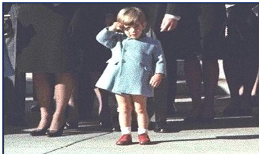
John ("John-John") F. Kennedy, Jr.