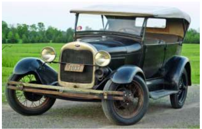
1928 Model A Phaeton

If you have stories or information to share, we would love to hear from you - - please contact us 313-386-3137. email at or bv at lpmuseum@gmail.com. Look for more information about the upcoming exhibit in our February 2017 newsletter.