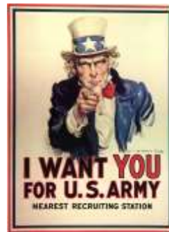
Iconic U.S. recruitment poster from WWI

A spaghetti dinner fundraiser was held on November 4 th at the Lincoln Park Moose Lodge #1665. Our deep thanks to all those who turned out to support this effort to replace the stolen Lincoln Park World War I memorial