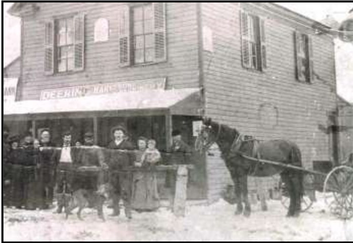
David LeBlanc's saloon and store located on east side of Fort Street circa 1890s, find this photo at Taqueria El Paisa Mexican Restaurant