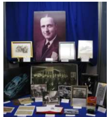
One of the display cases devoted to the Tucker exhibit this summer.