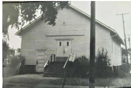
First Methodist Church Victoria Ave. (1921)