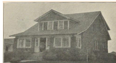
CALVARY EVANGELICAL LUTHERAN CHURCH LINCOLN PARK, MICHIGAN