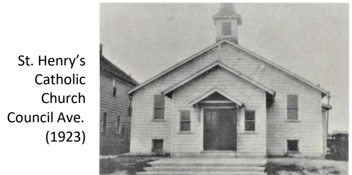
St. Henry's Catholic Church Council Ave. (1923)