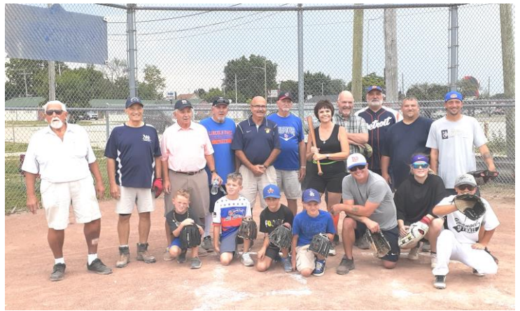
The alumni L.P. Little League squad who played in the Aug. 20 th ballgame, including the four younger boys.

The day's activities were well attended. The successful event has led to talk of making the Little League alumni game an annual affair, probably held earlier in the spring. More news to come.